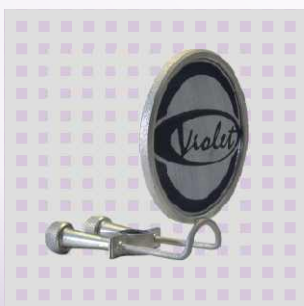
DSP spider type shockmount & metal mesh pop filter studio kit (VSMD + DPF)