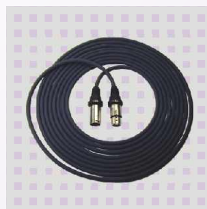
VMC-06 quad XLR3 microphone cable (6 m)

In the interests of product development, the specifications, construction and appearance of all above products are subject to change without prior notice and without obligation to install these improvements in any product previously manufactured.